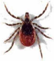
Ixodes pacificus , or deer tick, carries Lyme and other diseases

For more information visit CALDA's website www.LymeDisease.org